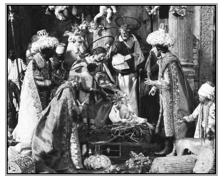
Detail of the Cucinello presepe

In Naples, it is even more than a holiday tradition: it is an ancient art of craftsmen making spectacular Nativity scenes and passing their skills from generation to generation. There is a worldwide famous pedestrian street in the historic district of Naples, via San Gregorio Armeno, that has hundreds of shops featuring handmade presepi all year around. Here visitors will see local artisans creating, exhibiting and selling the miniature figures that make up the Nativity scenes – not only the Holy Family, and three Magi, but also shepherds, fruit vendors, butchers, and other village characters, including parodies of world famous people from both past and