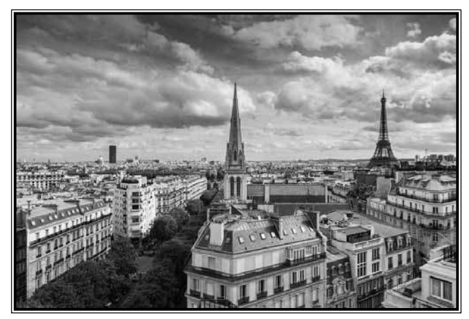
View of the American Cathedral of the Holy Trinity, Paris

For Americans living long-term in Europe, the churches in the Convocation serve as comfortable—and comforting—havens, "refuges" from the surrounding foreign-ness. But they also offer the means to escape an expatriate comfort zone.