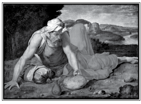
Elijah fed in the wilderness. Daniele de Volterra

After Pentecost comes what is often called "Ordinary Time" (probably from "ordinal," since the Sundays are all numbered). As a season, however, it's extra-ordinary, stretching its green mantle for more than half the year, all the way through summer and fall to the end of November, when Advent starts the cycle again.