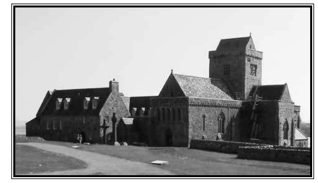
The Iona abbey

There were trips and adventures that I couldn't do this time. I didn't need to climb Dun I, the highest point on the island, because I had already done that, and I didn't need to go to the several beaches or take the boat trip to Staffa. I did walk the roads, visit the Abbey, and go to the shops. I got to observe and be grateful for the little things on the island as I walked slowly with my crutches: tiny flowers,