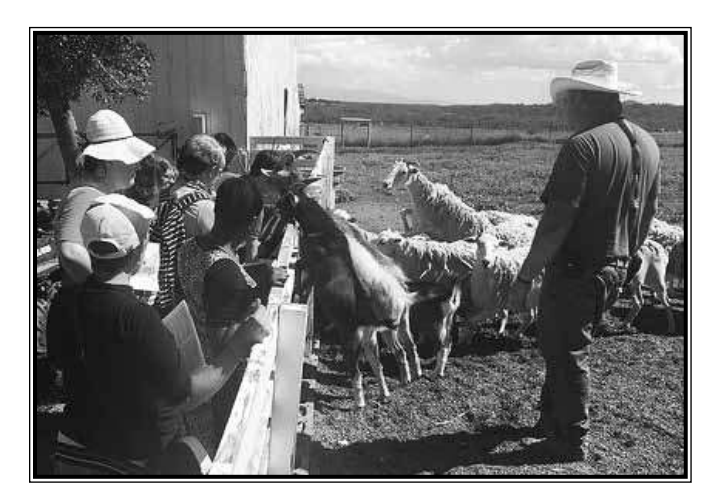
Slaughter Ranch, Arizona.

Looking back on my trip to Arizona, there were many memorable events that I enjoyed very much. The three activities that I enjoyed the most were visiting the Slaughter Ranch, painting the wall dividing the States and Mexico in Agua Prieta, and visiting the Imago Dei middle school in Tucson. The Slaughter ranch, located a few miles outside of Douglas and past a long dirt road, was a former military base and home. The ranch was also home to some rare animals, such as snails and snakes. I enjoyed visiting the ranch, especially seeing the immense size of the property and the spectacular view from the top of a hill. The next day, we went into Mexico to paint a mural on the fence dividing the States and Mexico. I enjoyed this very much as well, because I felt as though I was helping bring the work of the artist to life. We painted from around 9:00 to 11:30, and the result was a spectacular painting of an orange sunset with birds and trees. The mayor of Agua Prieta came and made a speech complimenting us on our work. The following day, we went to